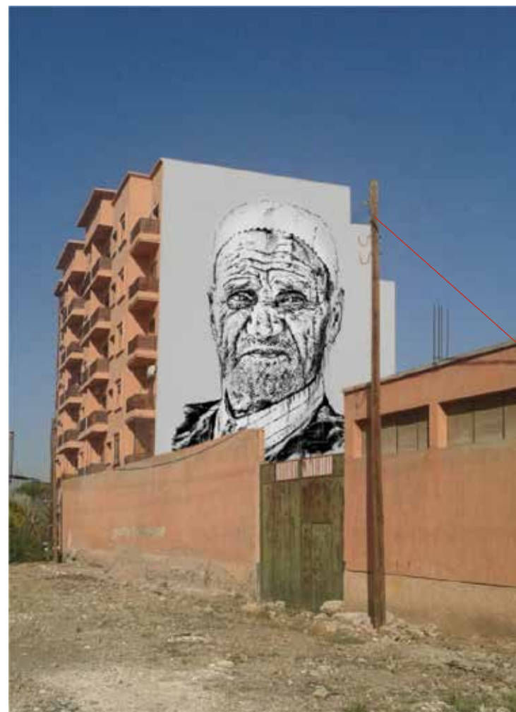
Marrakesh | Morocco