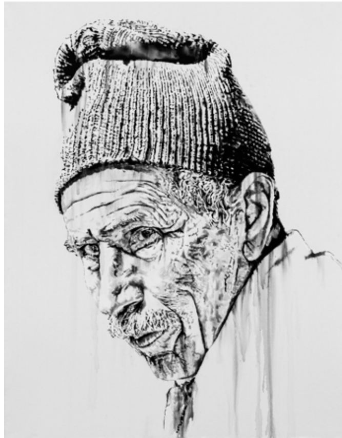
MOHAMED , 2014 Acrylic, Spray can and Indian ink on canvas 145.5 × 113.5 cm