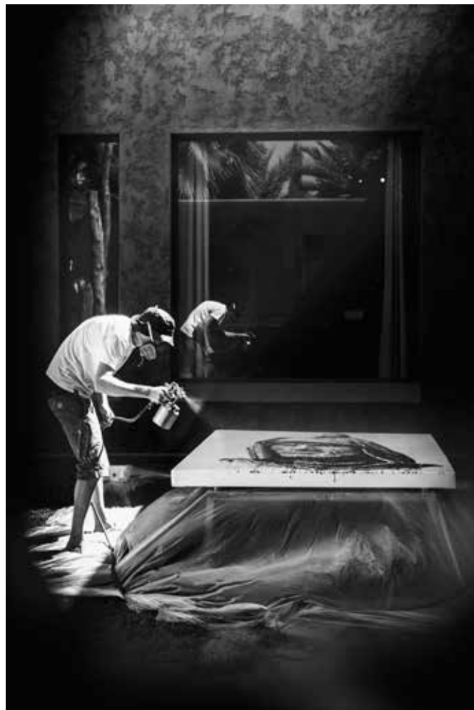
Marrakesh, Jardin Rouge, artistic residency