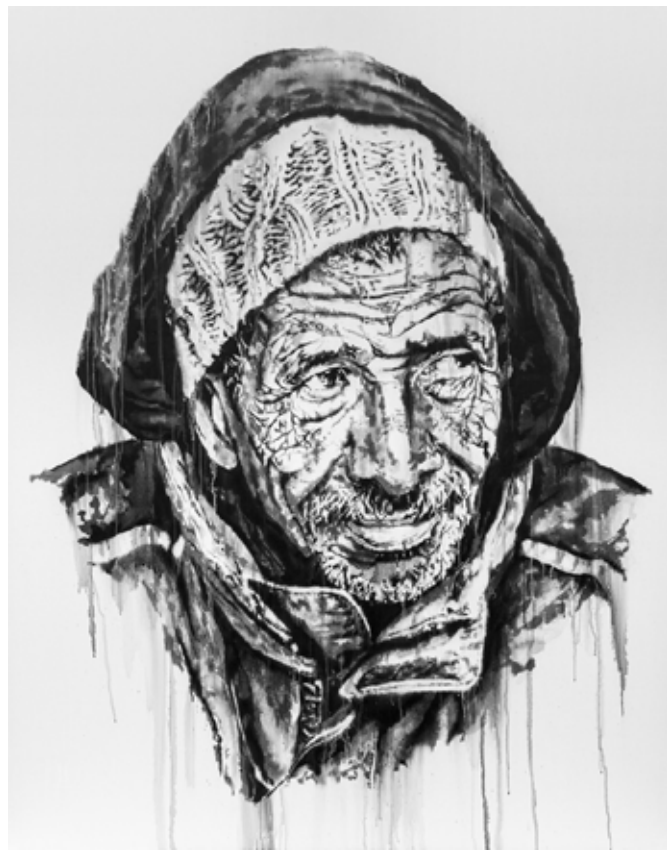
ISSAN , 2014 Acrylic, Spray can and Indian ink on canvas 145,5 × 113,5 cm