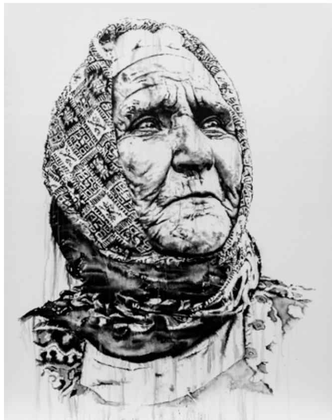
FADMA , 2015 Acrylic, Spray can and Indian ink on canvas 190 × 150 cm