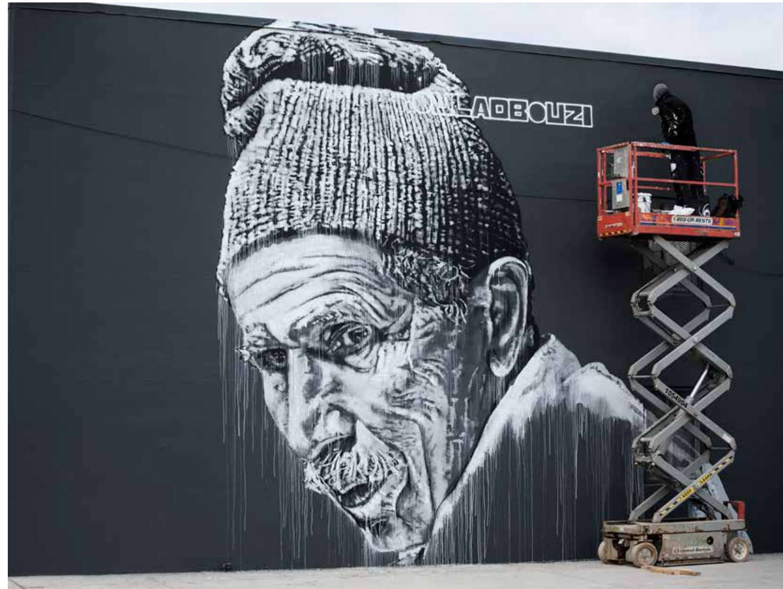
Brooklyn, December 2014