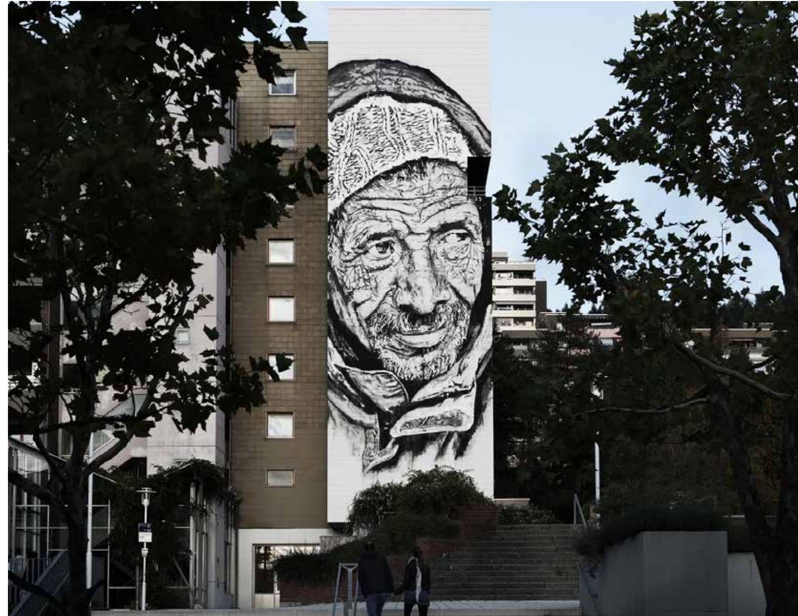
Heidelberg, August 2015