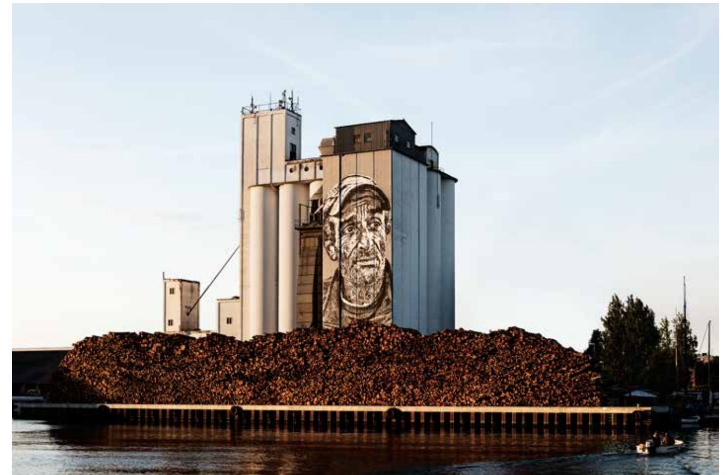
Harbor, September 2015