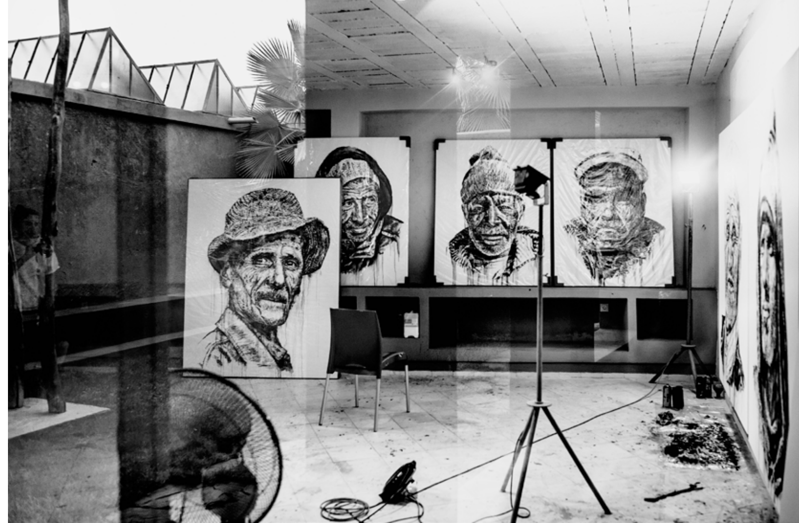
Marrakesh, Jardin Rouge, artistic residency

They remain thousands, shepherds, truck drivers driving overloaded machines, butchers, zelligers or simple masons used to ancestral and rudimentary equipment... It is impossible to name them all... Those who know Morocco, have come across and noticed those unbelievable truths.