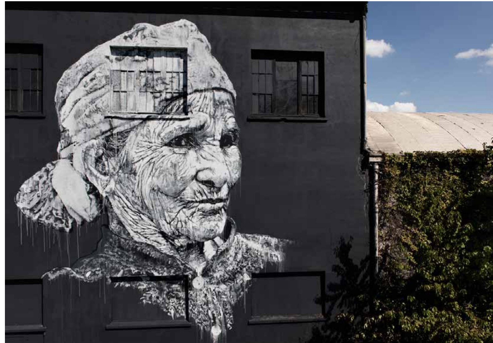
Espace Cobalt , September 2015