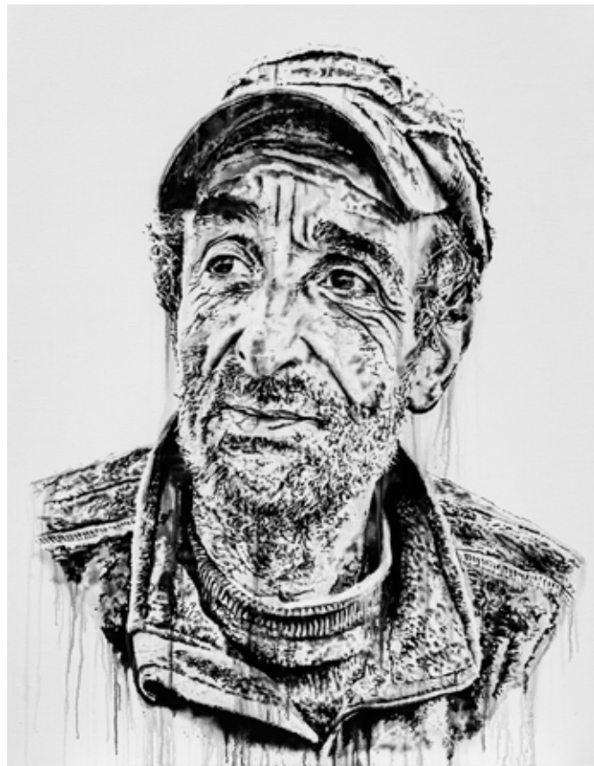
MOUNIR , 2015 Acrylic, Spray can and Indian ink on canvas 190 × 150 cm