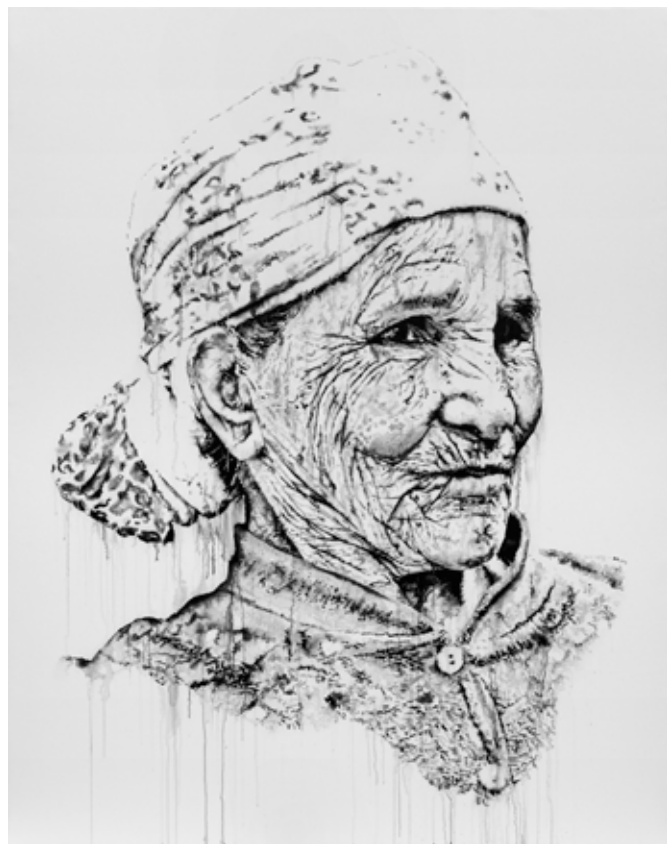
SMIAA , 2015 Acrylic, Spray can and Indian ink on canvas 190 × 150 cm