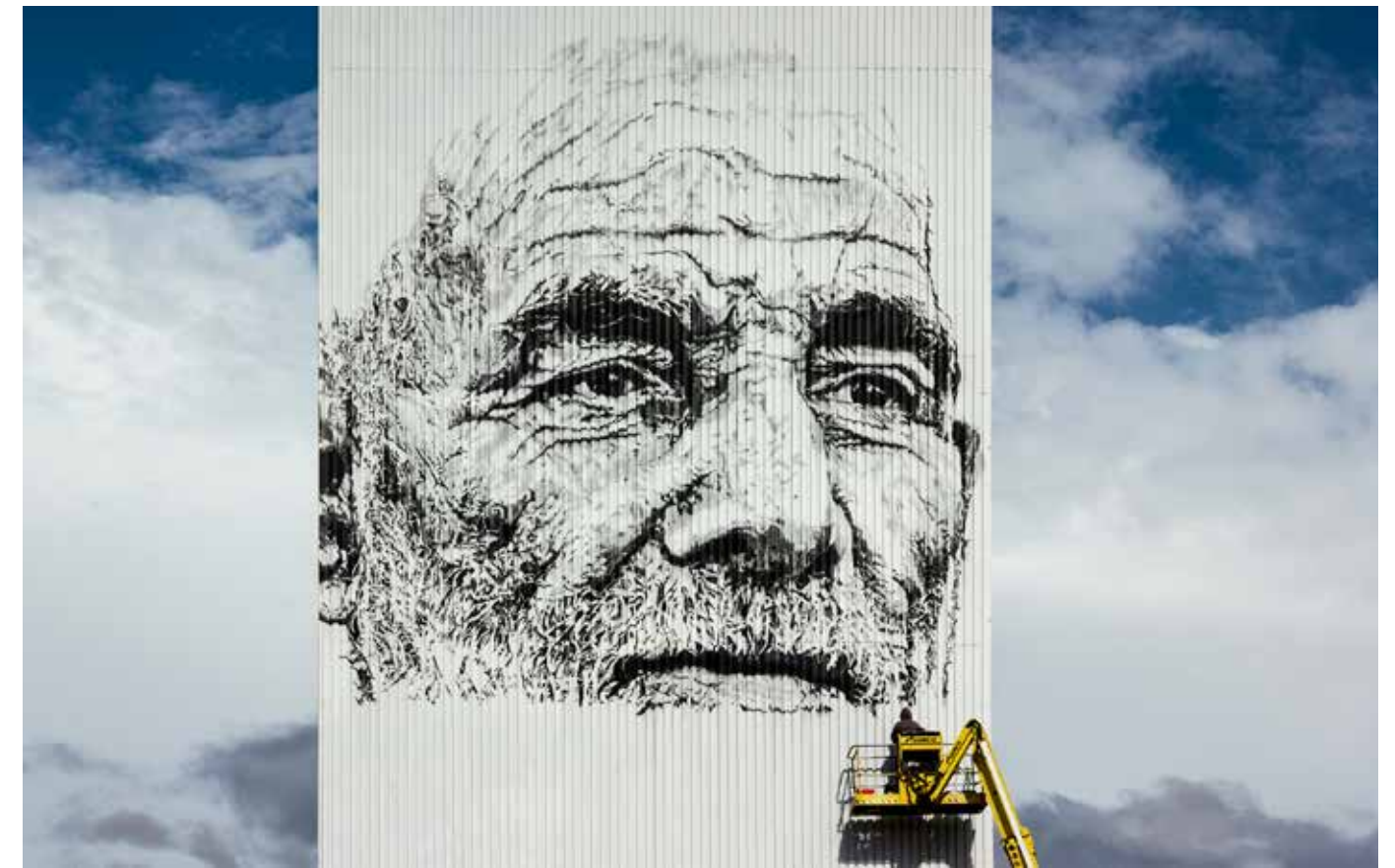
Building, July 2015