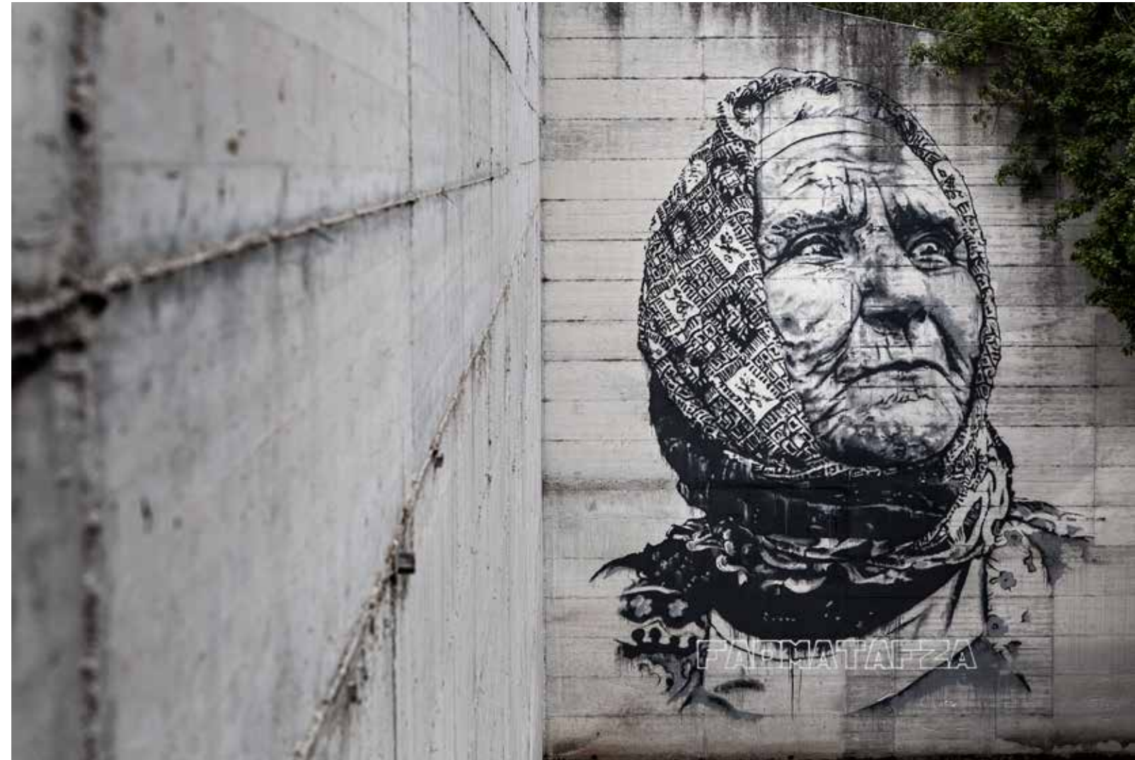
Arce, May 2015